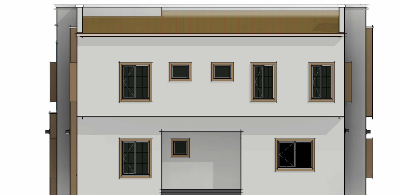
2 FD_REAR VIEW 1 : 100