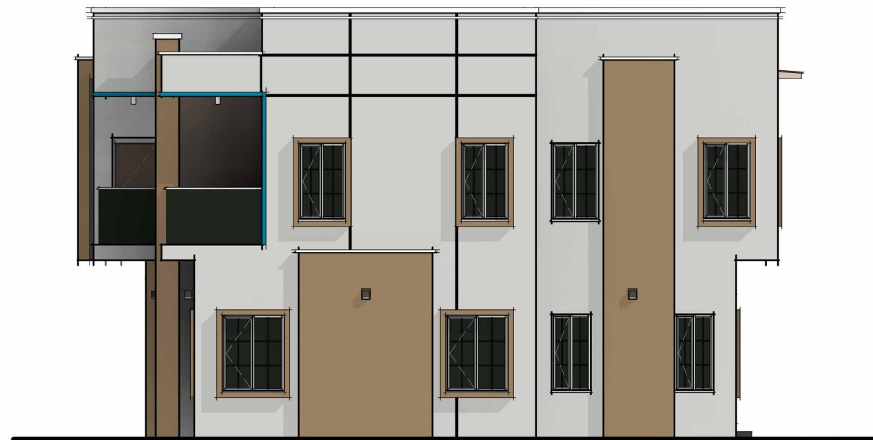
2 FD_RIGHT SIDE VIEW 1 : 100