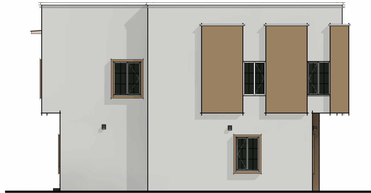
1 FD_LEFT SIDE VIEW 1 : 100