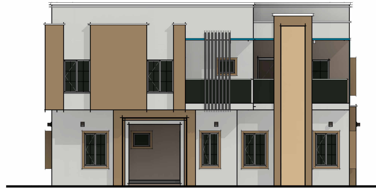
1 FD_APPROACH VIEW 1 : 100